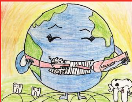
Brazil 2024 Winner