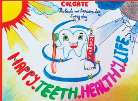
Tunisia 2024 Winner