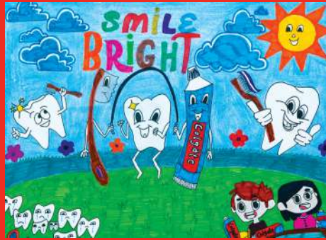
Pakistan 2024 Winner