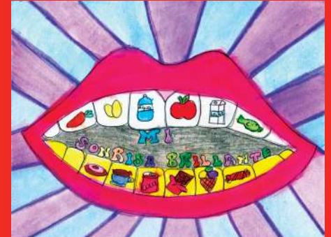
Mexico 2024 Winner